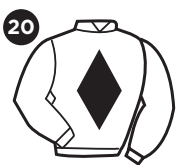
Diamond 10" vertical diamond