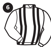
Stripes Alternate 2" vertical stripes