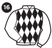
Diamonds 4" vertical diamonds