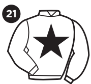
Star 10" solid star