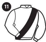
Sash 4" diagonal stripe from left shoulder to right hip