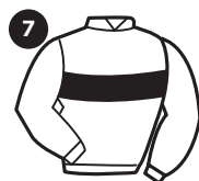
Hoop 4" Hoop