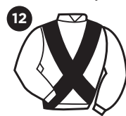
Cross Sashes 4" diagonal stripe from each shoulder