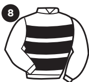
Hoops Alternate 2" Hoops