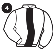
Panel 4" centre stripe