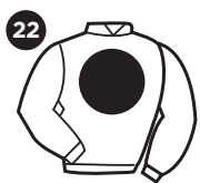
Disc 10" solid disc