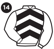
Chevrons Alternate 2" chevrons