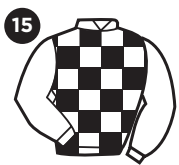
Check/Squares 1"-1 1/2" squares