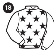
Stars 3" in diameter