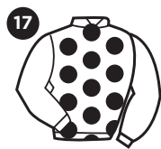
Spots 2 1/2" in diameter