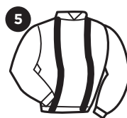
Braces 2" vertical stripe