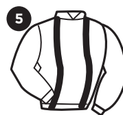
Braces 2" vertical stripe